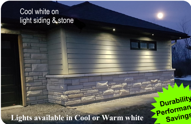
Cool white on light siding & stone

Elegant High-performance Industrial-grade LED Lighting