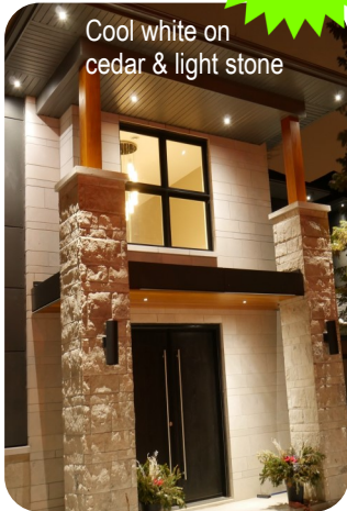
Cool white on cedar & light stone