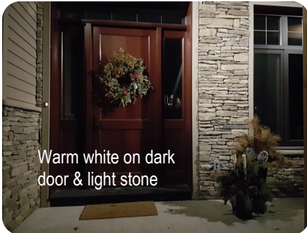
Warm white on dark door & light stone